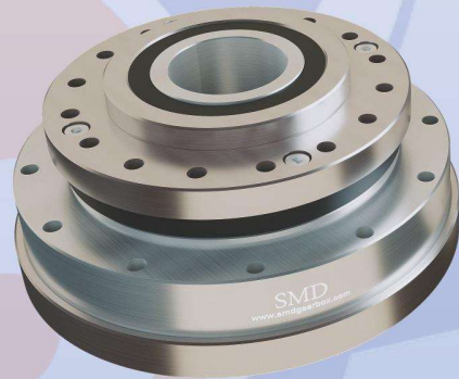
Harmonic Gearbox with Hollow Bore End - SSHG