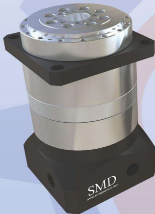
Planetary Gearbox with Flange End - SPF

INCREASE PRODUCTION EFFICIENCY & QUALITY